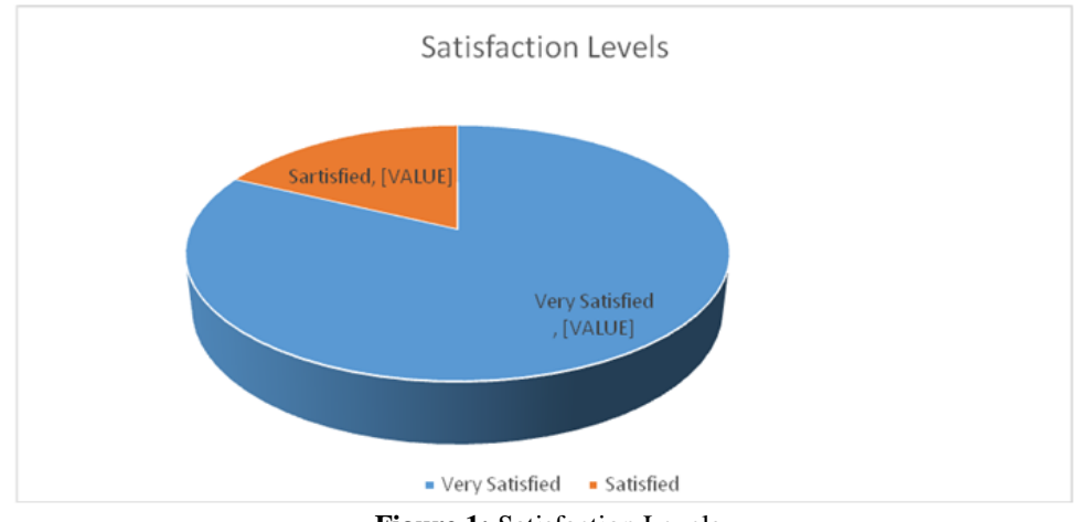
Figure 1: Satisfaction Levels

The study sought to establish whether the respondents were satisfied as a member of their group and whose findings are as shown in Figure 1.